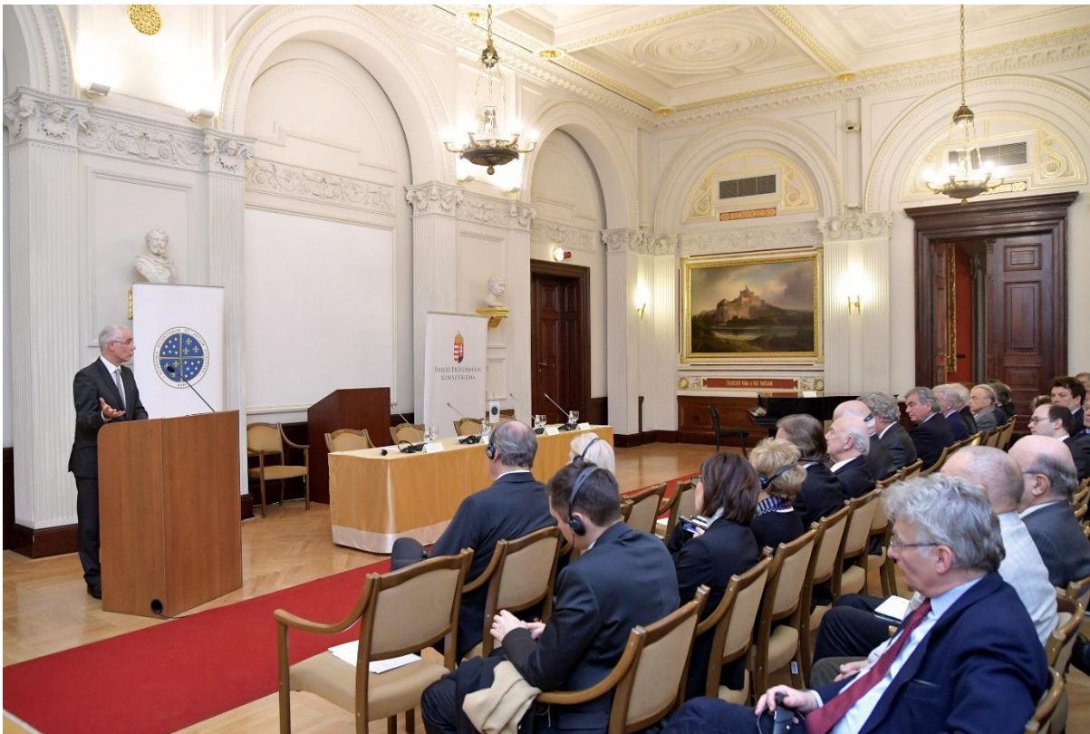
Conference at the Hungarian Academy of Sciences

We would like to thank our host – the Hungarian Academy of Sciences, and our co-organizer – the Ministry of Human Capacities.