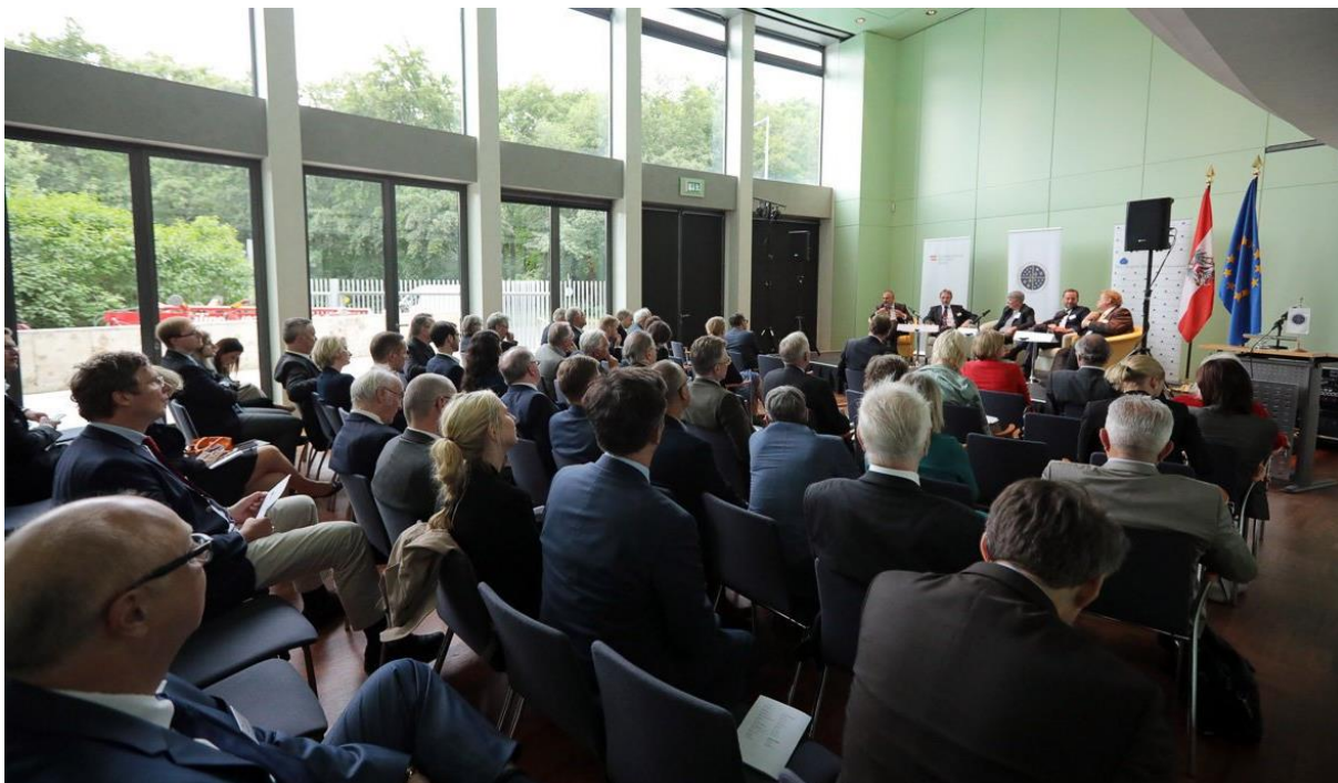
Conference at the Austrian Embassy Berlin

We would like to thank our host – the Austrian Embassy Berlin, and our co-organizer The Aspen Institute Germany.