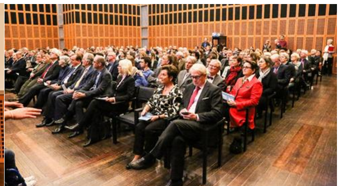
Ceremony at the Wallraf-Richartz-Museum in Cologne