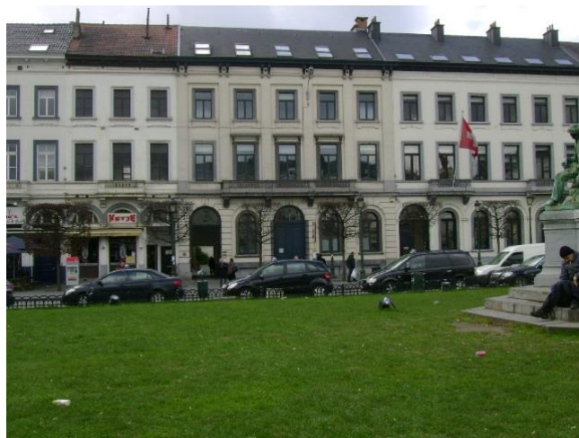
Our representation in Brussels