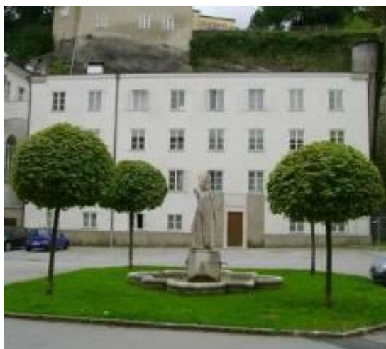
Headquarter Salzburg, St. Peter Bezirk 10