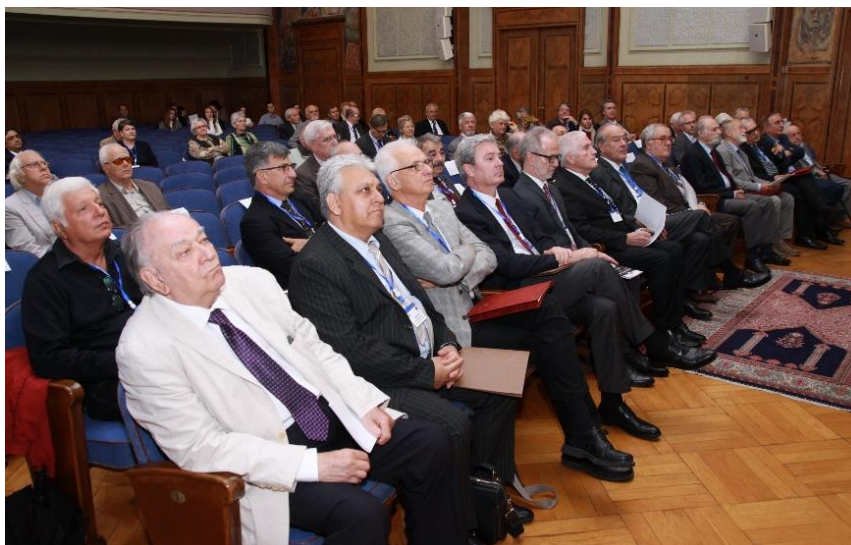
8 th Danube Academies Conference, Serbian Academy of Sciences and Arts