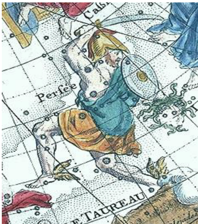
Fig. 1. The constellation of Perseus by Philippe La Hire (Andromeda and Cassiopeia – detail from Planisphere celeste, Philippe La Hire 1705) (under the Creative Commons Attribution-Share Alike License, published on 3.9.2019).

D. Ogden, in chapter 5 of the monograph Perseus , analyzes the use and falsification of the myth of Perseus. 131 The image of Perseus is used to legitimize city-states, dynasties and individuals. It also facilitates comparisons between Greek and non-Greek city-states. On the one hand Perseus was the greatest Greek hero, whose adventures were recognized in places, on the other hand he was the ancestor of the tribe that was the greatest threat to anything Greek: the Persians. As a Greek hero and traveler, Perseus was an ideal figure for the Greeks of the Hellenistic diaspora. His travels to Persia and Syria made the Greeks of the Seleucid kingdom feel local, while his travels to Egypt and Libya favored the inhabitants of the Ptolemaic kingdom. The rational investigation of Perseus's figure followed a different line. The rationalist writers, in interpreting the myth, followed their own traditions, which went hand in hand with the mythological point of view, although several times their interpretation was influenced even by the tradition of their own time. However, the investigation of the myth by the rationalists prepared the ground for the allegorical presence of the myth during the Middle Ages.