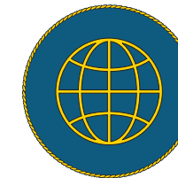
VII. World Religions