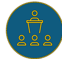
VIII. Corporate and Public Governance