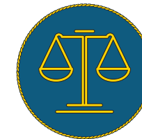
V. Social Sciences, Law and Economics