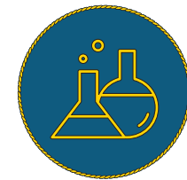
IV. Natural Sciences